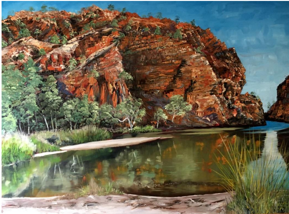
Oasis (Ellery Creek) , Oil on Canvas, 91 x 121cm

Yering Station Art Gallery / Main Gallery