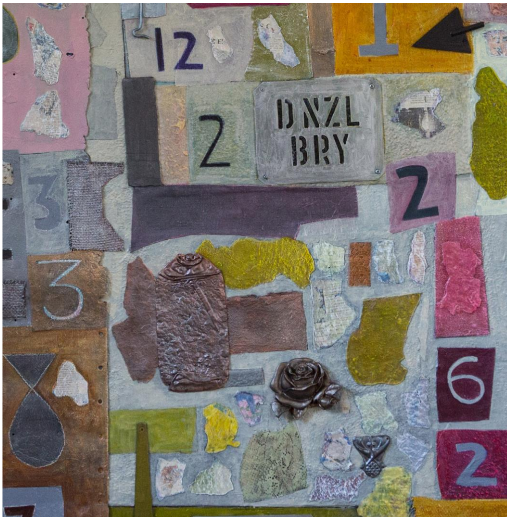
Detail from Text , paper, canvas, tin, found objects, acrylic paint on board, 155 x 157cm, $3,600

In 'Constructions' Shirley has created what she refers to as drawings in space, within which layers are built up from found materials and objects. A bulky tangibility is achieved, and the disparate media are unified through skilful juxtaposition and through the artist's uncanny